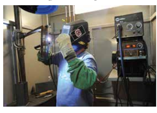
In the new facility, there are 48 state-of-the-art welding booths, with the capacity for 72 students. A big change is the no-wait factor for using the welding booths.